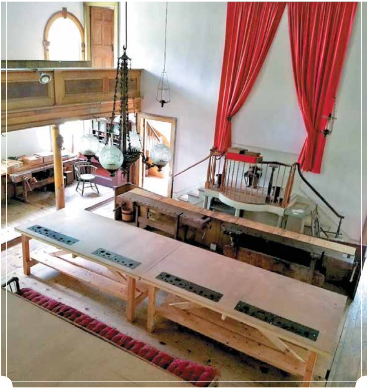
TOP TO BOTTOM: THE NEW LEAD SILL WILL PROTECT THE MEETINGHOUSE'S FOUNDATION; THE BUILDING UNDER RECONSTRUCTION, THE OTHER STRUCTURE IS LONG GONE; THE SPACIOUS INTERIOR SET UP FOR A TINSMITHING CLASS.