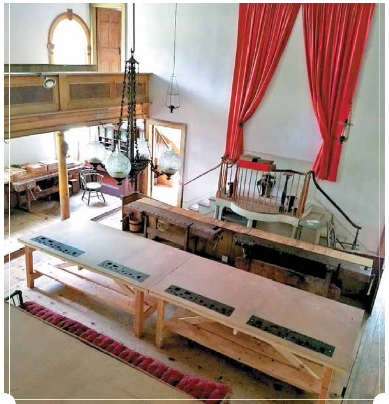
TOP TO BOTTOM: THE NEW LEAD SILL WILL PROTECT THE MEETINGHOUSE'S FOUNDATION; THE BUILDING UNDER RECONSTRUCTION, THE OTHER STRUCTURE IS LONG GONE; THE SPACIOUS INTERIOR SET UP FOR A TINSMITHING CLASS.